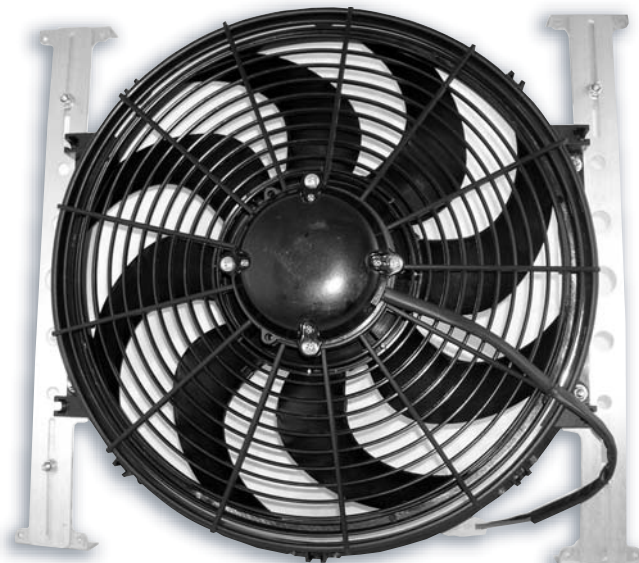
(FAN NOT INCLUDED WITH BRACKET KIT)